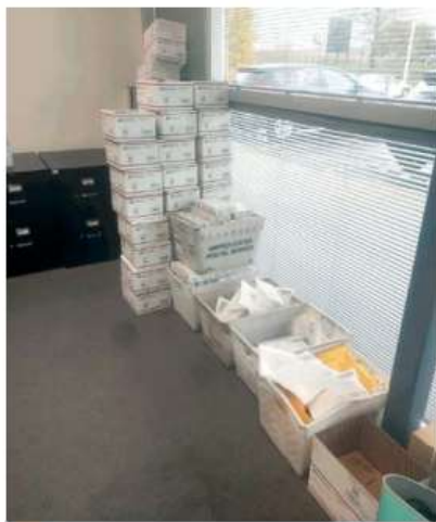
The 2023 membership cards are getting ready to be shipped!