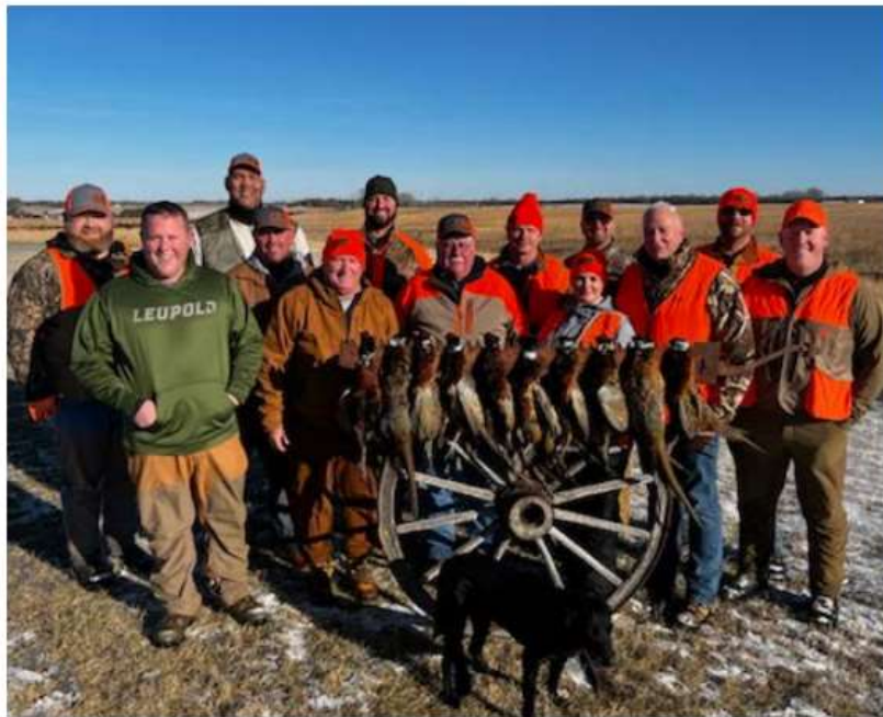
South Dakota pheasant hunt