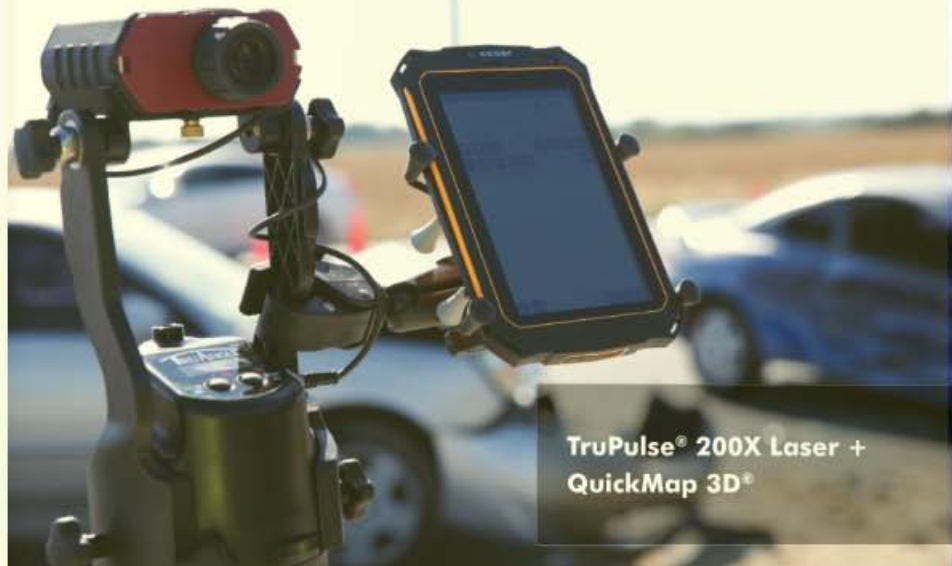
TruPulse® 200X Laser + QuickMap 3D®

The Auxiliary is ready to work for you. We are the wives, husbands, sons, daughters, parents, siblings and extended family members of your lodge. We are the front-line supporters of your law enforcement community. What impacts and involves us. We have a direct, vested interest in you, your job, your welfare and your lives. As we continue our efforts to support law enforcement and their families, we work closely with our parent lodges on fundraisers and events to ensure that the FOP and their families know that we will "Never Let Them Walk Alone." We would be pleased to provide you with more information regarding how you can join the Auxiliary or how to organize an auxiliary for your lodge. The Auxiliary can be reached at the Grand Lodge Fraternal Order of Police website, www.fop.net (under About, select FOP Auxiliary from the drop-down menu). FOP